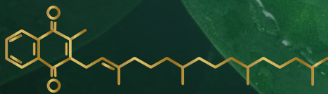
Vitamin K1 molecular structure

In addition, vitamin K2 includes a range of related forms which differ in their number of sidechain isoprenyl groups. When there are four groups, it is vitamin K2-4 (or MK-4, for menaquinone K-4). If there are seven groups, it is K2-7 (or MK-7). Studies have shown that K2-7 has better bioavailability than other forms of vitamin K2 38 – that is, it is absorbed more easily by the body. It also has a longer half-life than vitamin K2-4 39,40 , which results in more stable serum concentrations.