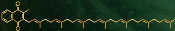
Vitamin K2-7 molecular structure